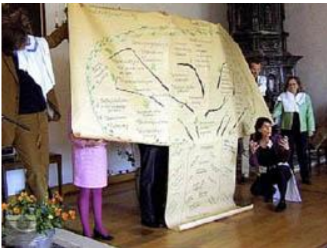
Explaining the Learning Festival tree

At the same time the exchange of experiences with colleagues from different regions and projects has been very useful and some contacts may develop to further cooperation.